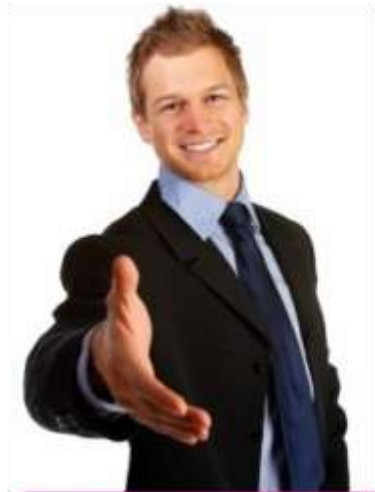
Salesman / Project manager